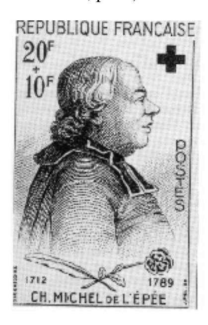
Charles Michel de L'Epée – the founder of the world's first school for deaf people