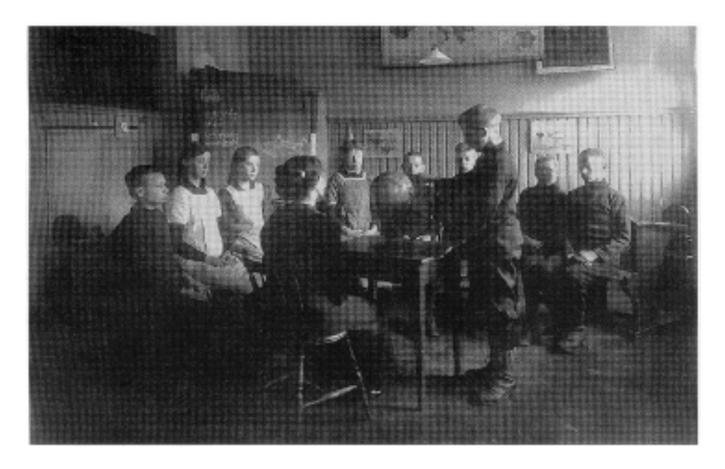
Oralist teaching of geography for deaf children at Christiania offentlige Skole for Døve (later Skådalen School), Oslo, Norway, in 1915